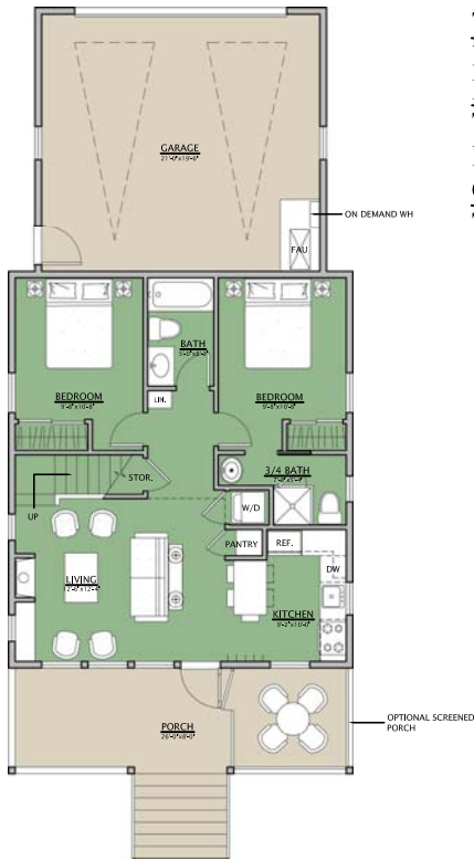
Main Level Floor Plan