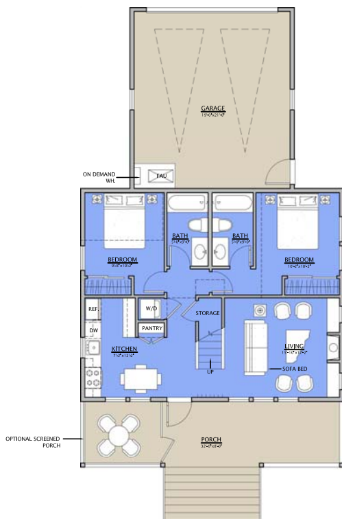
Main Level Floor Plan